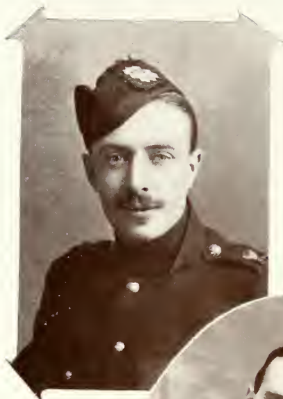
Lieut. D. MCD. COWIE. Killed in Action, 1915.