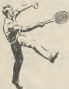
G. & M. Badminton Rackets —unsurpassable values.

CRICKET. The "William Gunn" Auto-graph Cricket Bats are acknowledged to be the finest produced. You cannot beat a Gunn & Moore Bat for excellence.