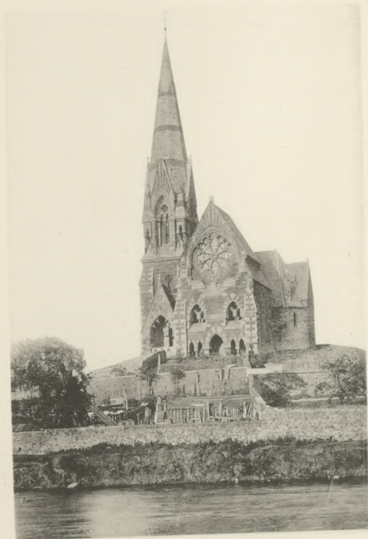
Maclure, Macdonald & Co., Glasgow.