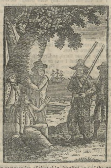
"I was commander of that ship, (replied one of the prisoners) my men have mutinied against me; and if they do not murder me, they intend to leave me and these two gentlemen ashore in this desolate place; they are but in that thicket, and I tremble

At this instant I saw a villain lift up his arm to kill one of the prisoners, but he did not strike him. The men having left the prisoners, and gono up into the woods, I went up to them with my man Friday, and said to them, "What are you, gentlemen?" they startled at the noiso; but prepared to fly. I then said in English, "Gentleman, perhaps you may have a friend near you, whom you little expect. Tell me your case."