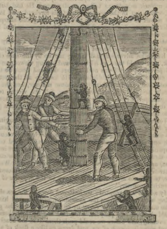
all over with red hair, came swimming towards us, and boarded our ship, chattering a language of which we could not comprehend a word, In an instant they took down our sails, cut

We soon found the eaptain's information to be true; for a multitude of frightful sayages, about two feet high, and covered