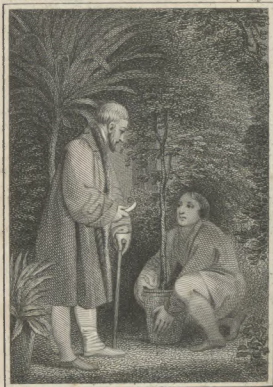
Scottard Scul. del.