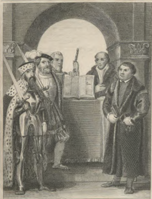
The Treaty of Pilsau.