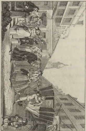
[A Fleet Marriage Party. From a print of the time.]