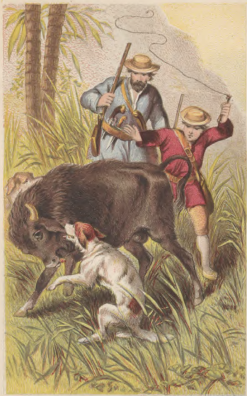
The dogs, nothing daunted, sprung at their enemy, and laying hold of a young buffalo, commenced dragging him towards us.