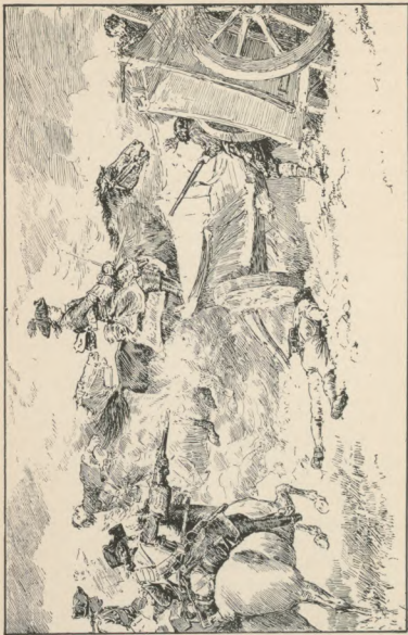
JACK AND HIS TROOPERS CAUGHT IN AN AMBUSCADE.