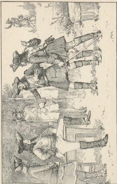
THE PRETENDED DESERTERS DECEIVE THE DUKE OF ARCOS.