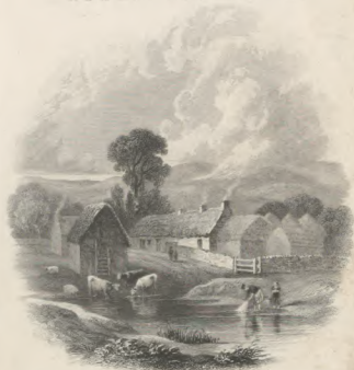
The Birth-place of Colley