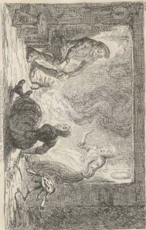
The great Elbow of the World by George Cruikshank Nov. 2. 1830