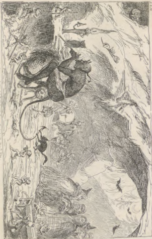
The great island of Hibernia by George Smith, 1830.