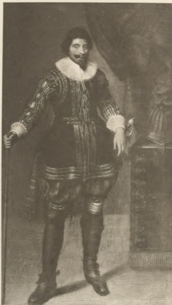
Archibald, 7 th Earl of Argyll