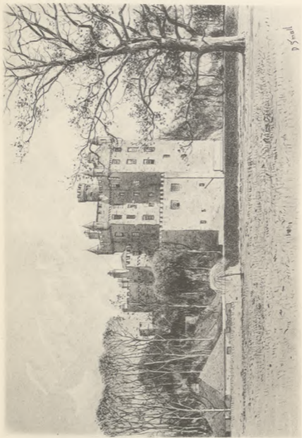
CASTLE LYON (NOW CASTLE HUNTLY).