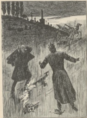
EACH LEAPED FROM HIS OWN SIDE INTO THE ROAD- WAY. Page 61.