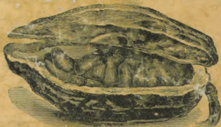
COCOA POD CUT OPEN SHOWING THE NUTS