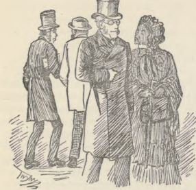
papers. They need twa to vouch for their delivery." Ane o' them wis Maister Pringle!

i' their hauns like gas accounts. I lookit closely at them, for