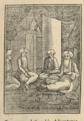
SINDBAD relating his Adventures.