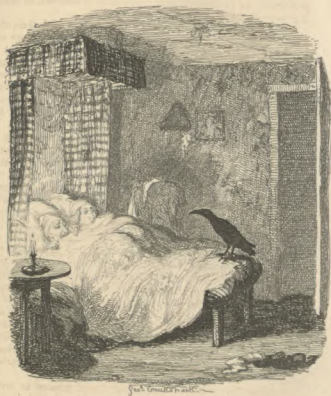
Scrap's fright at the Raven.