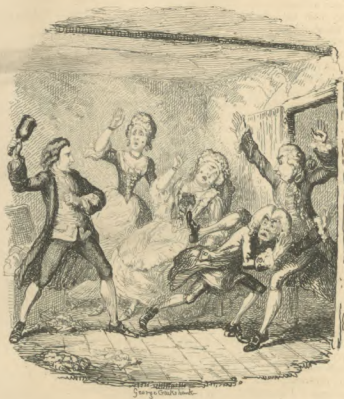
Roderick Ransom threatening to execute justice on Hawkey