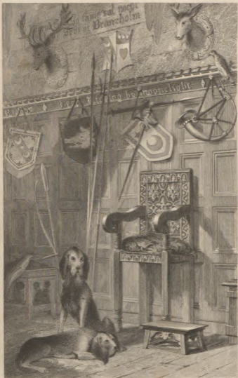
Drawn by J. M. W. Turner