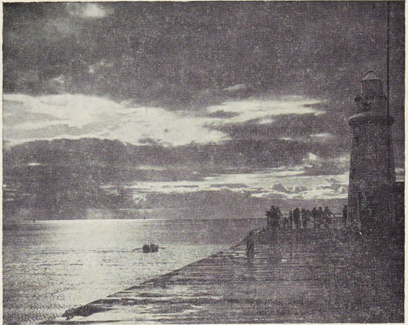
"After the Storm" on the Moray Firth.