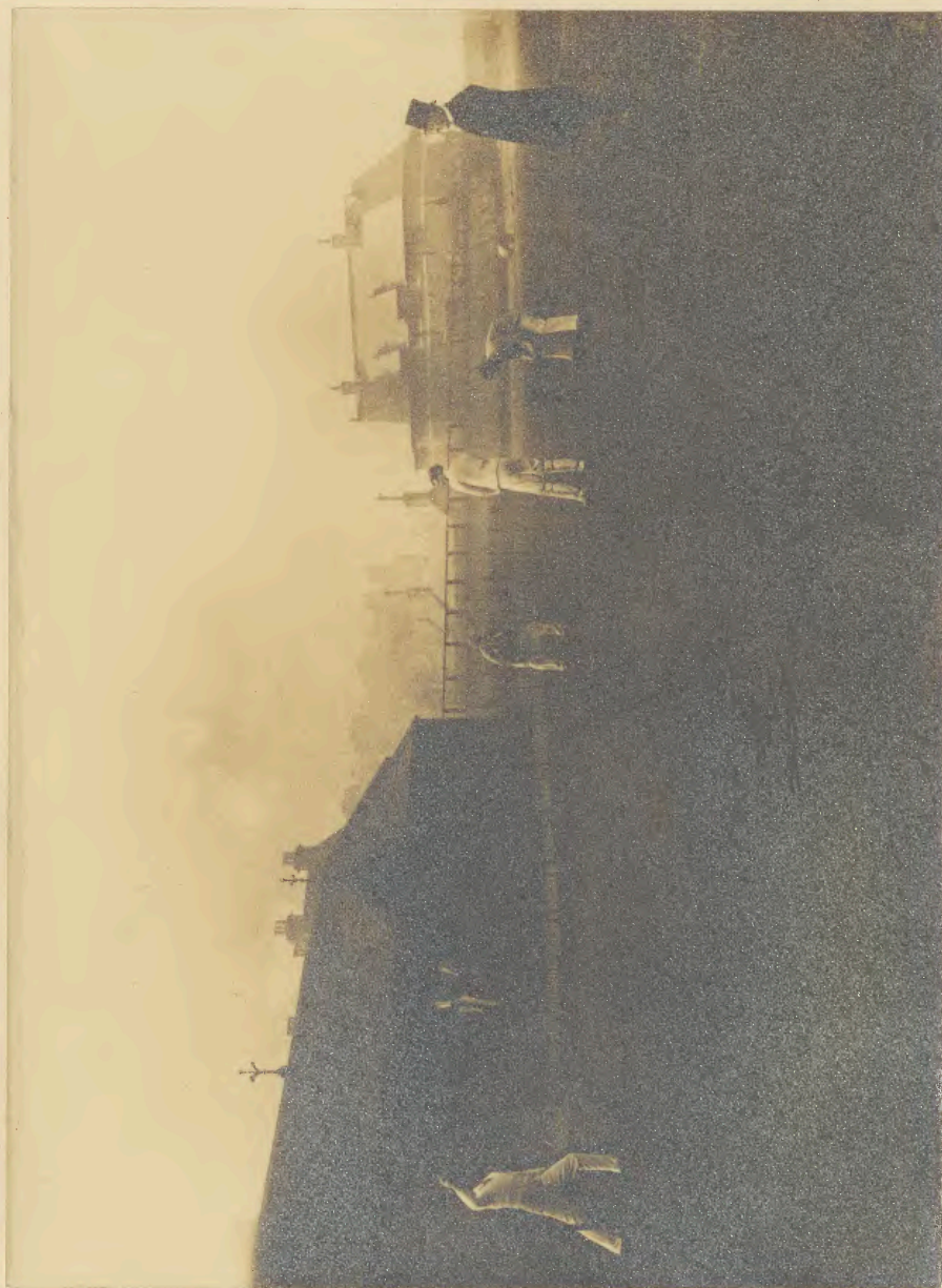
THE GRANGE CRICKET CLUB.