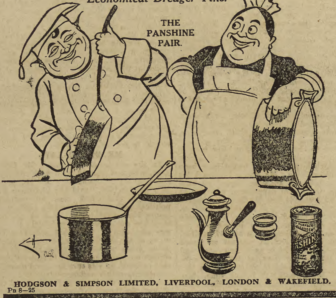
HODGSON & SIMPSON LIMITED, LIVERPOOL, LONDON & WAREFIELD.

OF ALL GROCERS AND OILMEN. In 1d. Packets, and 3d. & 6d. Economical Dredger Tins.