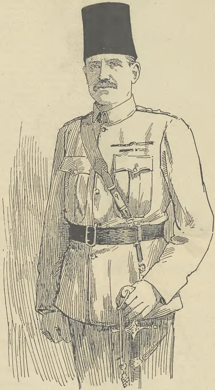
General Sir Hector Macdonald,

WHOSE COMING COURT MARTIAL IS THE TALK OF THE HOUR.