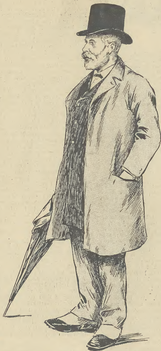
Aberdeen Worthies : The Lord Provost.