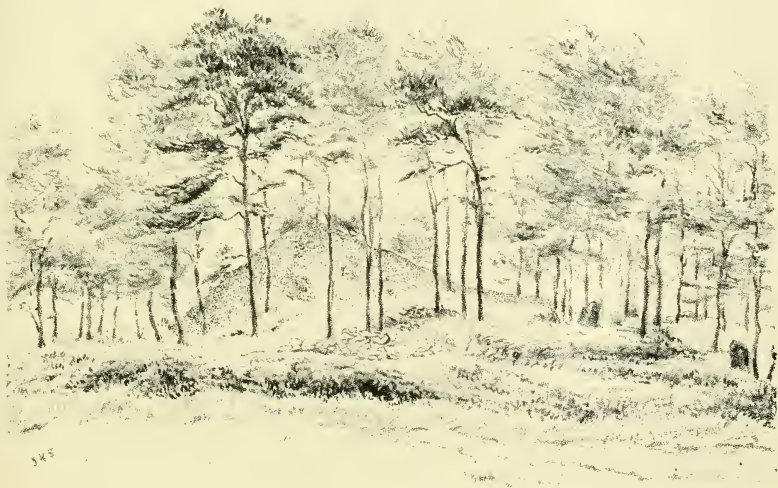
Great Cairn at Achnacridhe (Achnacree)