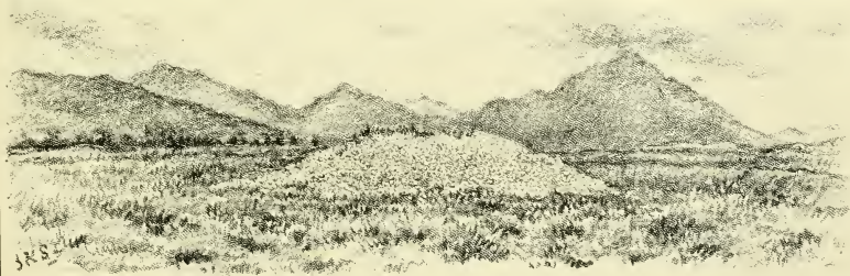
Baron's Cairn - Lochanabeich - Connel Ferry.