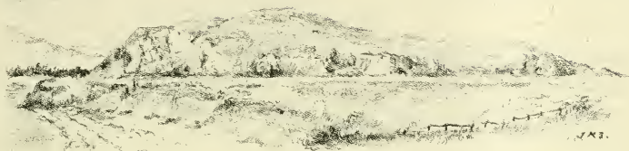
Dun Mac Uisneachan from the shore S.W. fancifully called Beregonium, castle of Fergus and Selma.