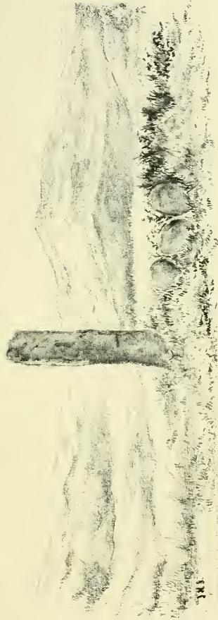
Standing stone called "Clach Dhiamuid" at head of Lochneil and oblong enclosure below