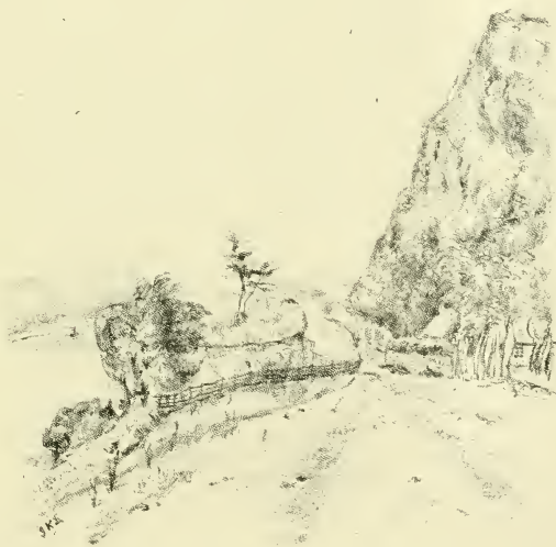
Dun Bhaile an Righ or Dun Valanree - extremity of Ledaig.