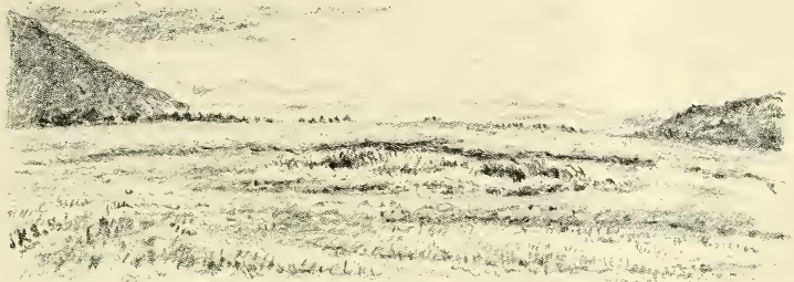
Lake dwelling at Ledarg - (Connell Ferry) the long line is the border of the old lake - The view towards Loch Awe with the beginning of Cruachan on the left.