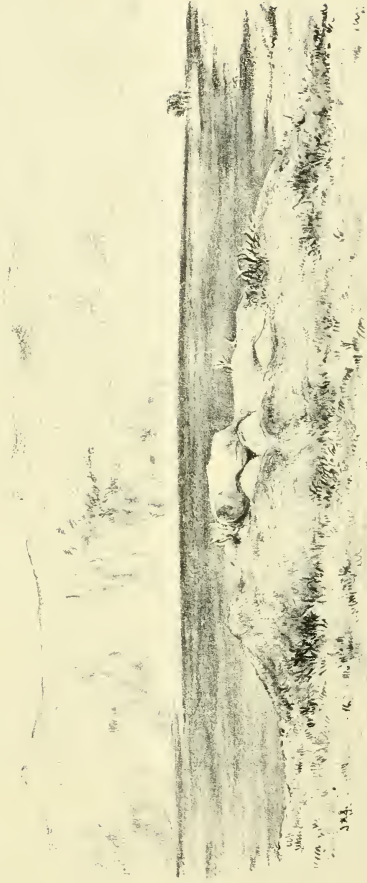
Megalithic double burying place near outlet of Lochneil. The little wooded island to the right was a lake dwelling