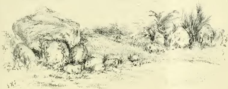
Tomtechs at Achnacriath beag or Achnacree beag