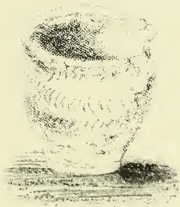
Urn from a cave under Dun Bhaile an Rìgh (Valanree)