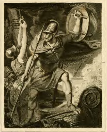
Heath sculp "