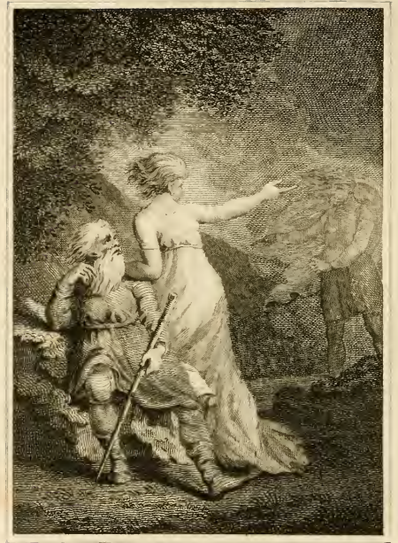
Atkinson . dal f