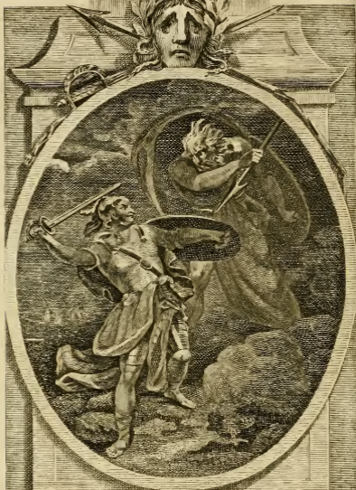
FINGAL Engaging the Spirit of Loda.