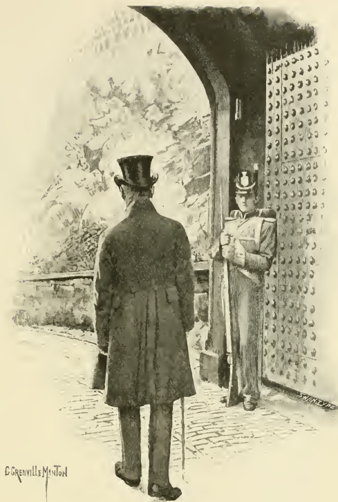
"He disappeared . . . under the shadow of a ponderous arch."

And with a wave of his hand he disappeared abruptly down a flight of steps and under the shadow of a ponderous arch.