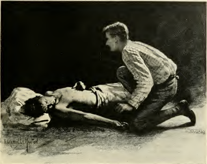
"I ran to my fallen adversary, kneeling by him."