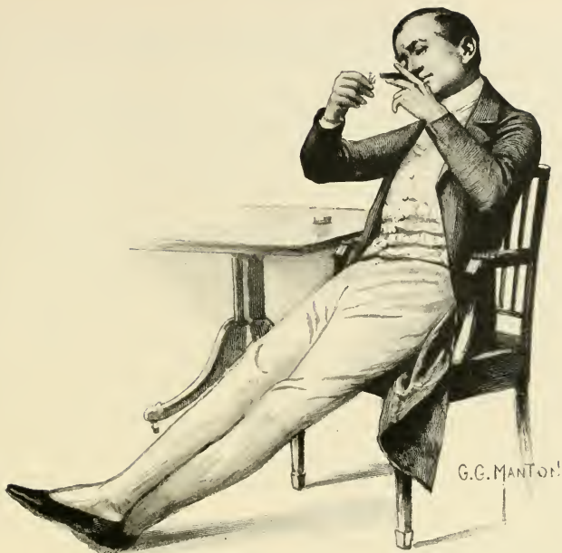
"He deliberately lighted a cigar."