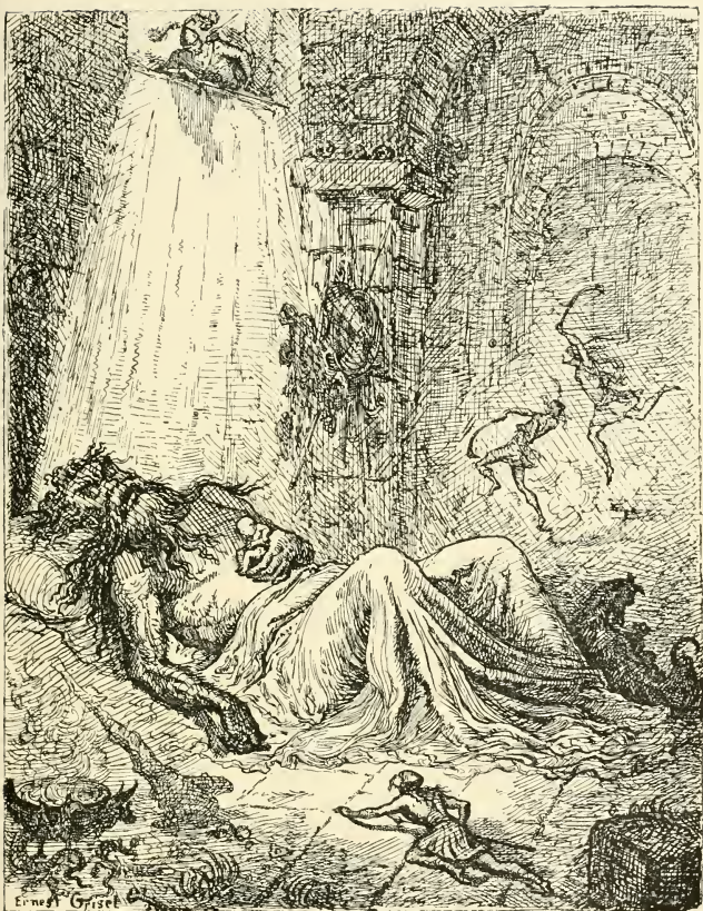
THE GIANT ASLEEP.