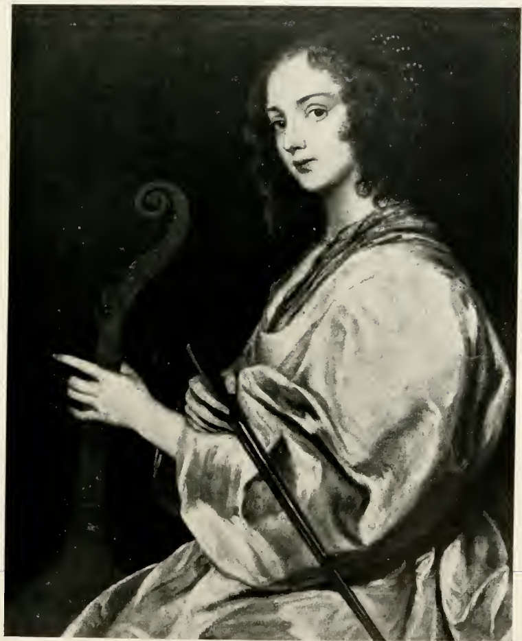
MARIE RUTHVEN, WIFE OF SIR ANTONY VAN DYCK