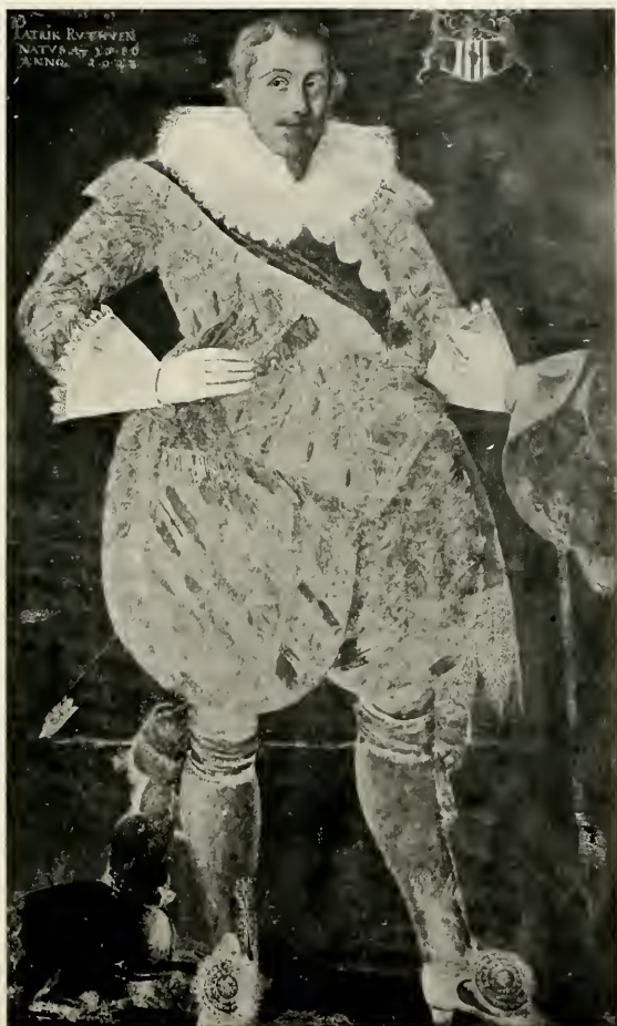
GENERAL PATRICK RUTHVEN (AFTERWARDS EARL OF FORTH AND BRENTFORD)

From the Portrait in the Imperial Museum, Stockholm