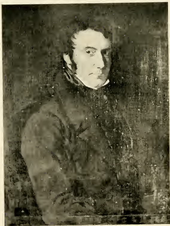
JAMES, FIFTH LORD RUTHVEN OF FREELAND