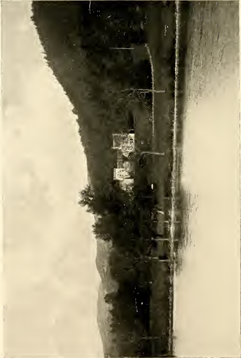
INVERMORISTON HOUSE, FROM LOCH NESS.